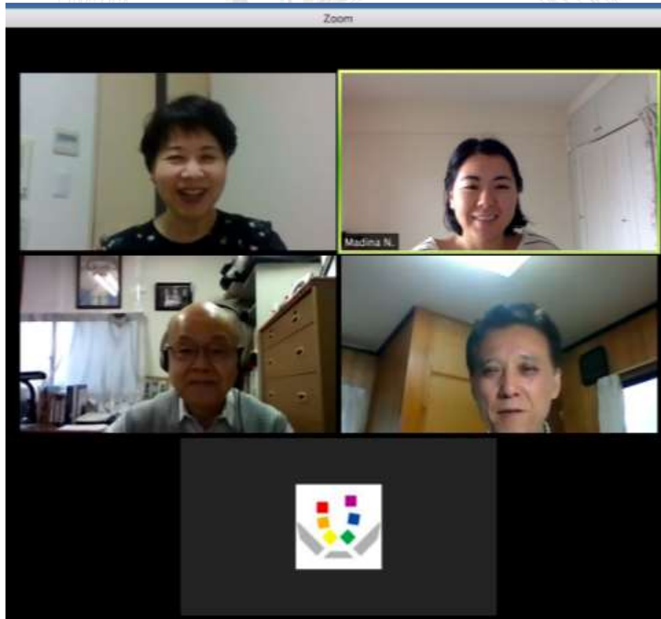
Photo: UNISEC Secretariat during zoom meeting, May 2020