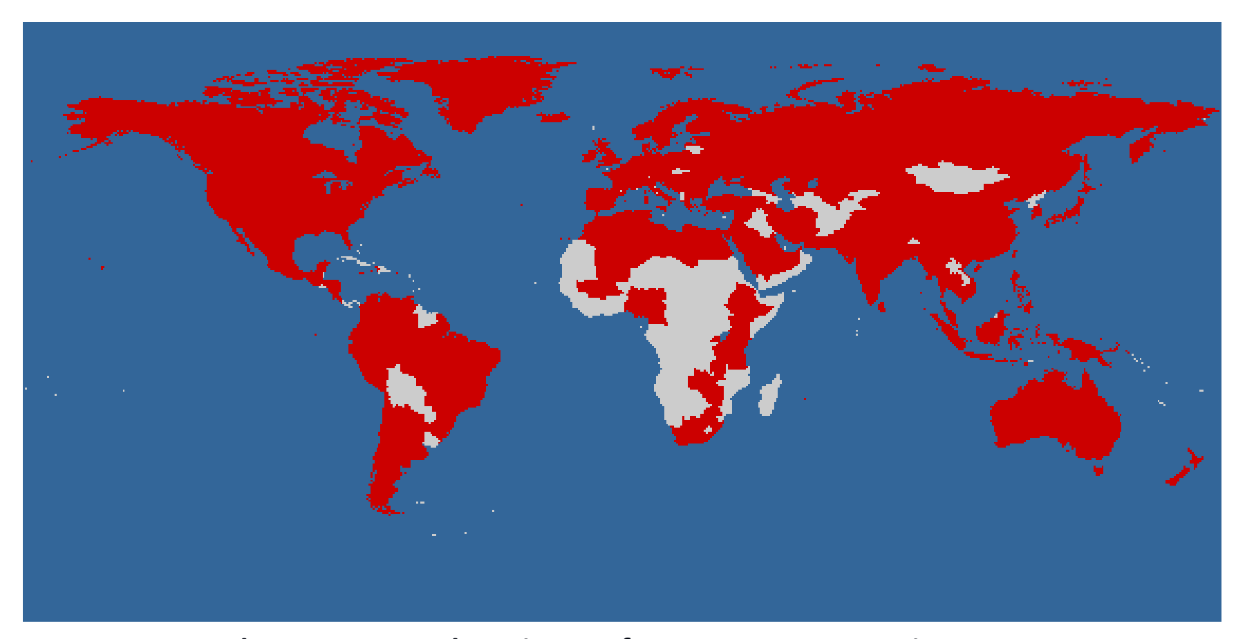
The 4400+ ISU alumni come from over 105 countries