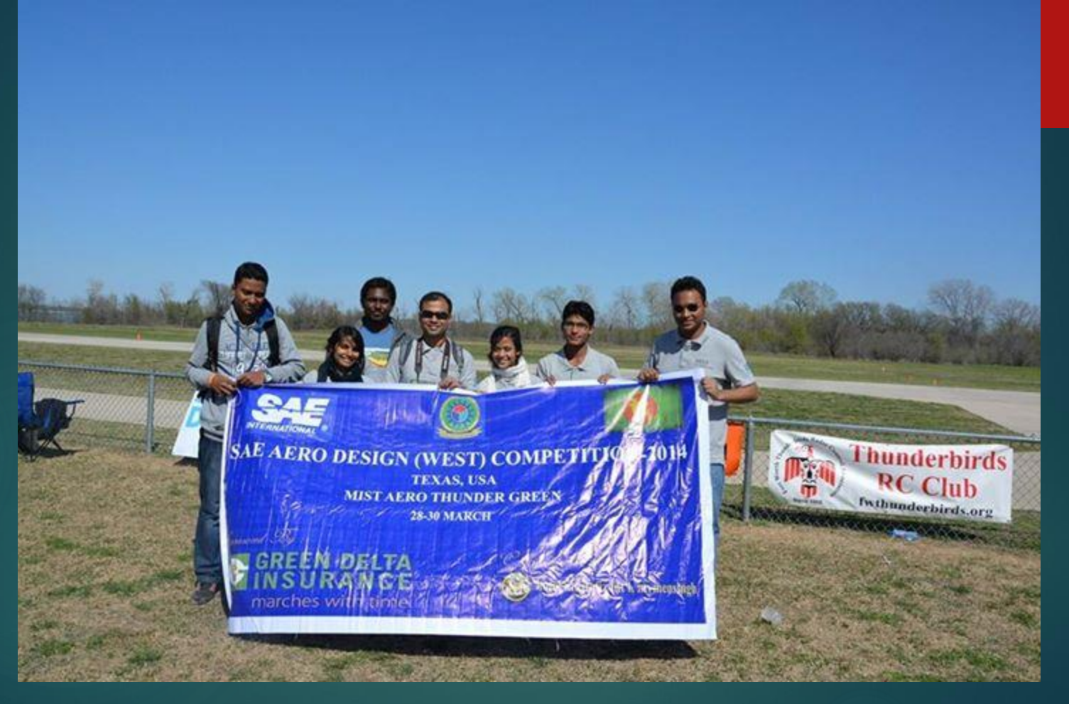
A team from MIST placed 4th (Payload category) in SAE Aero design competition