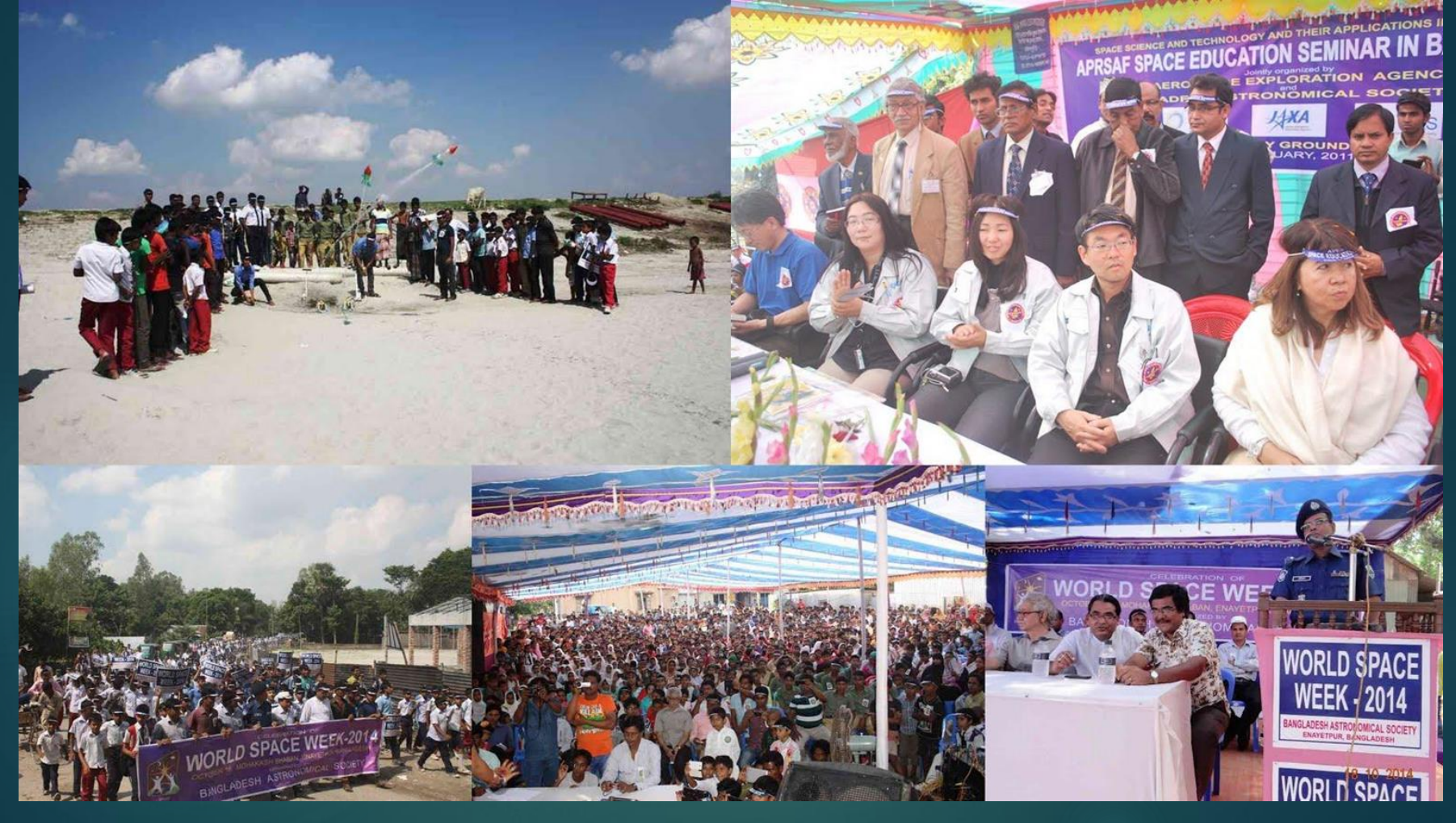
Some more picture from observation of World Space Week