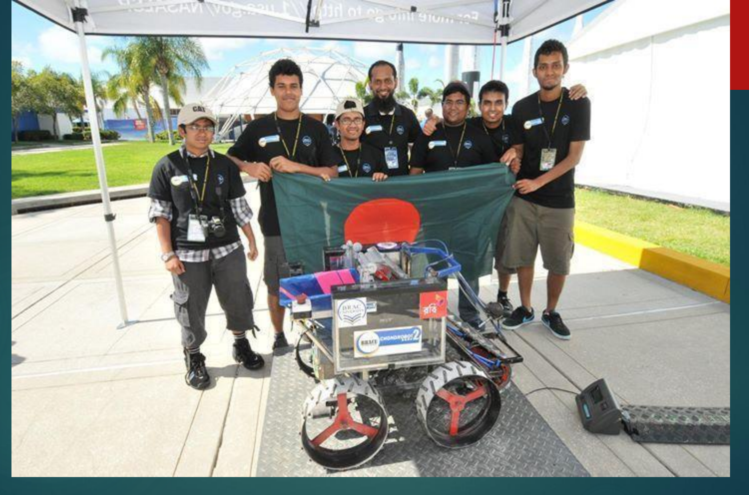
BRAC University's "Chondrobot 2" team secured 12th place in NASA Lunabotics Competition 2012.