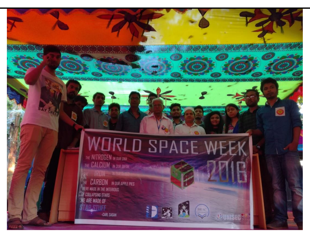
Picture 2: Bangladesh Astronomical Society invited UNISEC Bangladesh team at Enayetpur