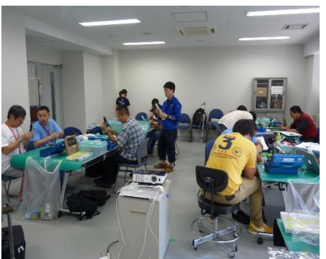
CanSat Hands-on Training