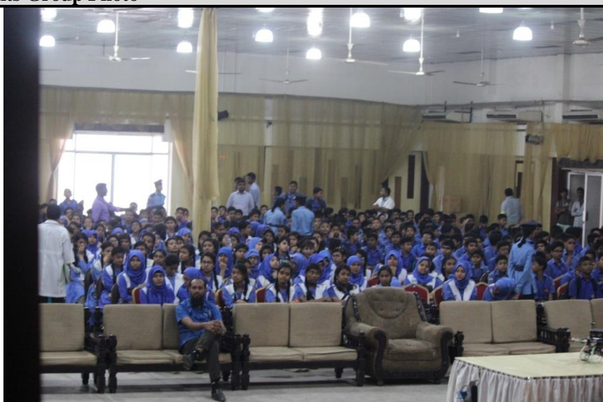
Picture 1: Celebrated "World Space Week 2016" in BAF Shaheen School & College