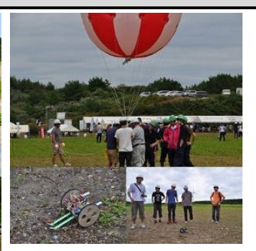
Participants for Satellite Launche