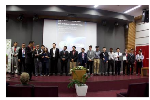
MIC4 finalists and reviewers, Oct. 21, 2016, Verna, Bulgaria