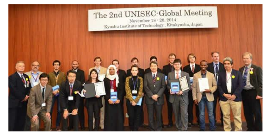
MIC3 finalists and reviewers, Nov 19, 2014, Kitakyushu, Japan