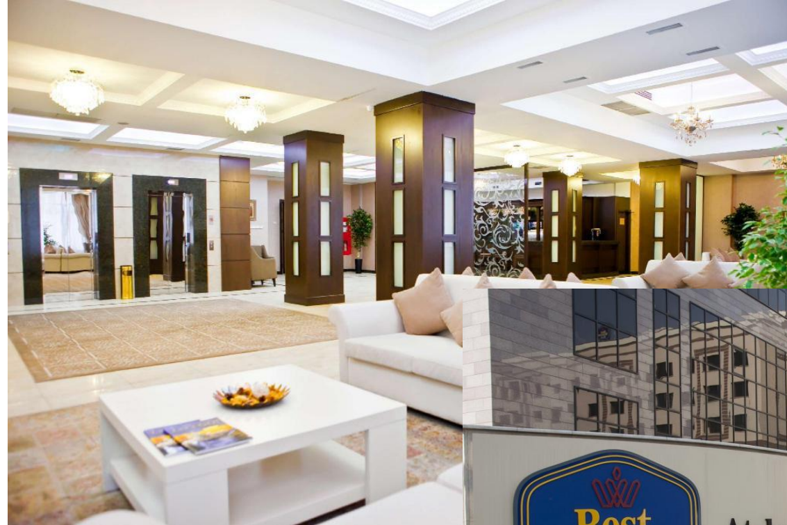
Atakent park hotel