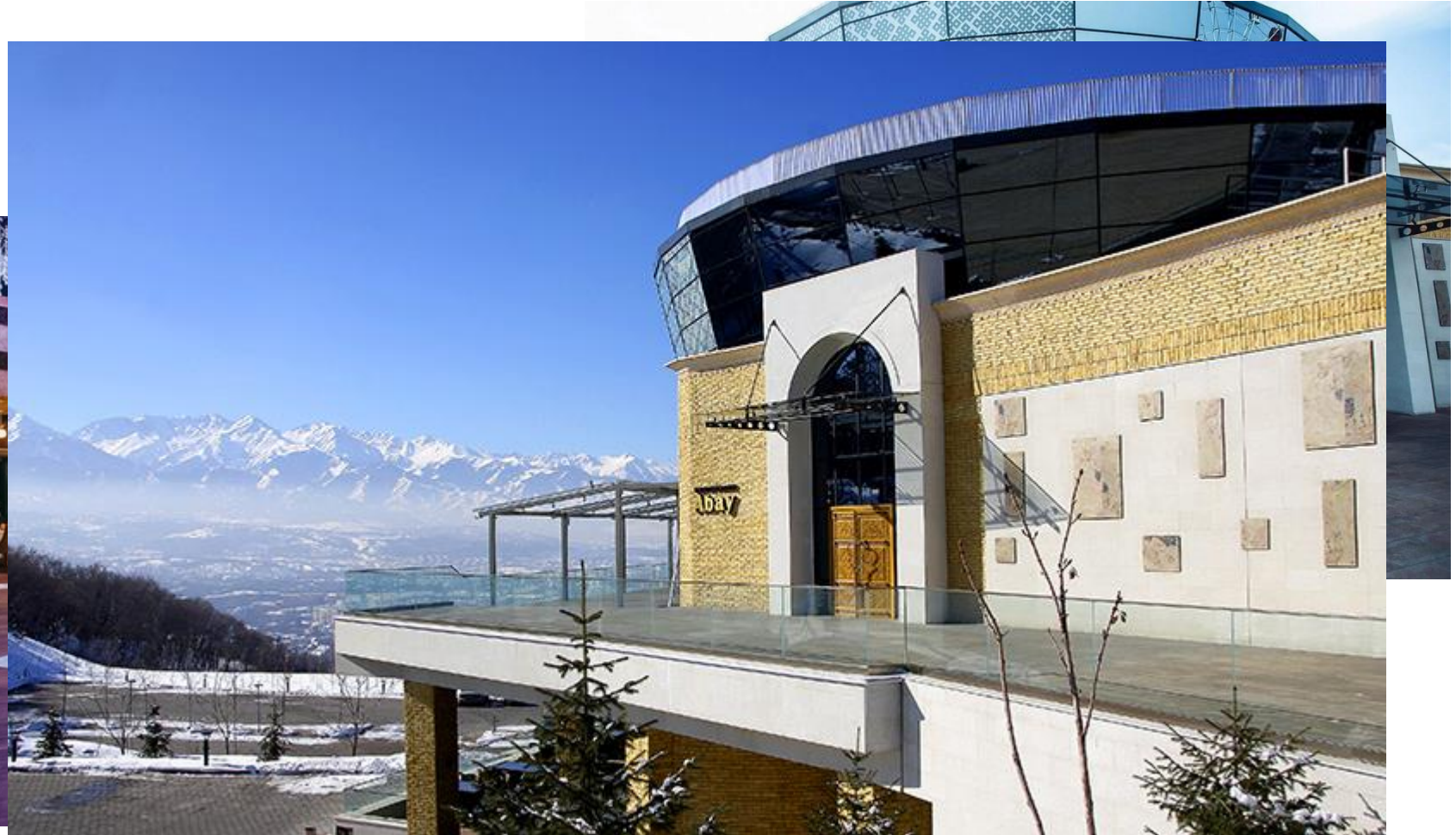
Gala dinner (Abay – Kazakh restaurant in mountain)