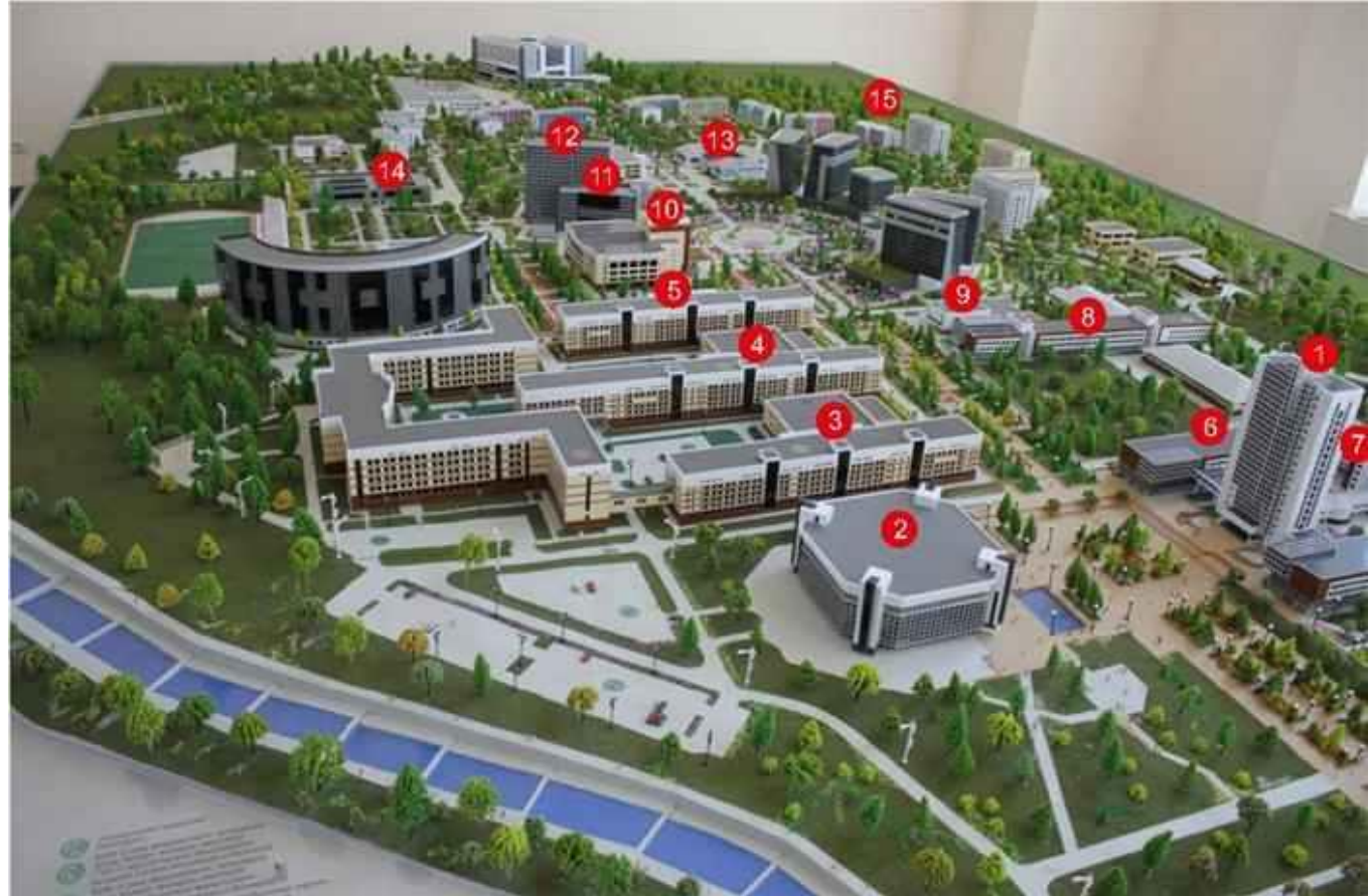
Al Farabi Kazakh National University