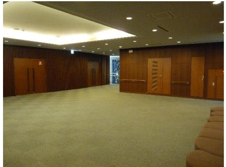
○ Exhibition (Foyer of the Conference Hall)