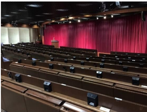
○ Conference Hall