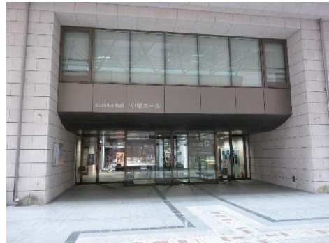
○ Entrance of Koshiba Hall