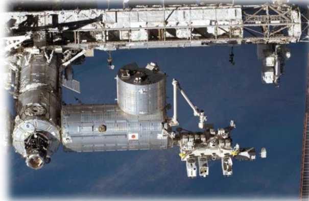
Japanese Experiment Module (JEM) "Kibo", J-SSOD(CubeSat Deployer)