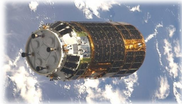
(HTV) Propulsion System