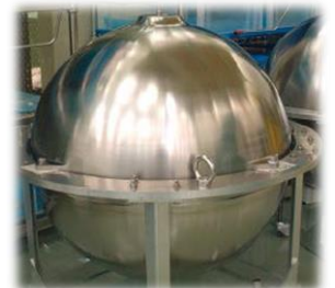
Tank for HTV