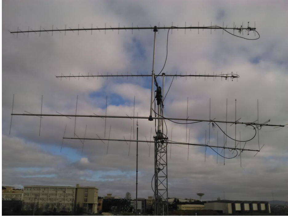
Istanbul Technical University USTTL Ground Station Antennas