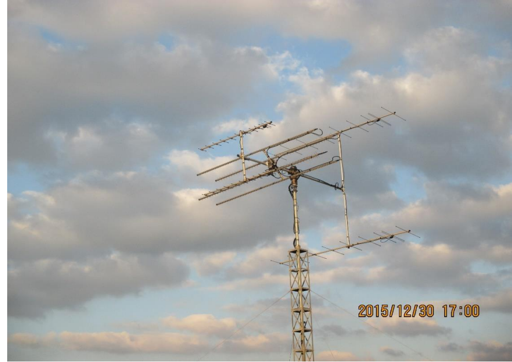
Kyushu Institute of Technology Ground Station Antennas