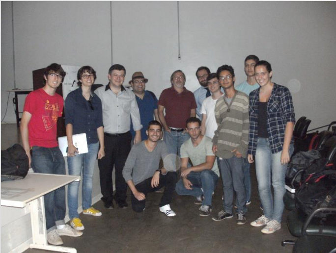
University of Brasília