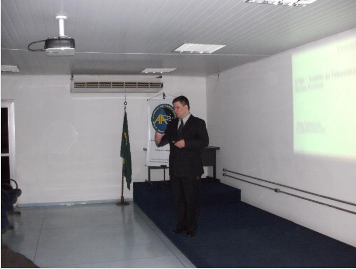
Brazilian Aerospace Association