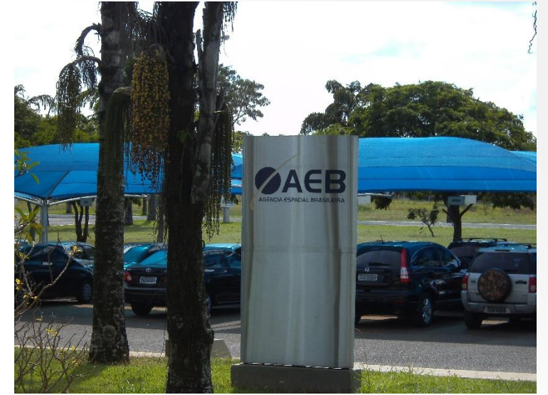
Brazilian Space Agency