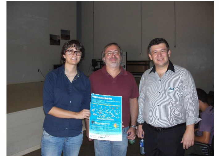
University of Brasília