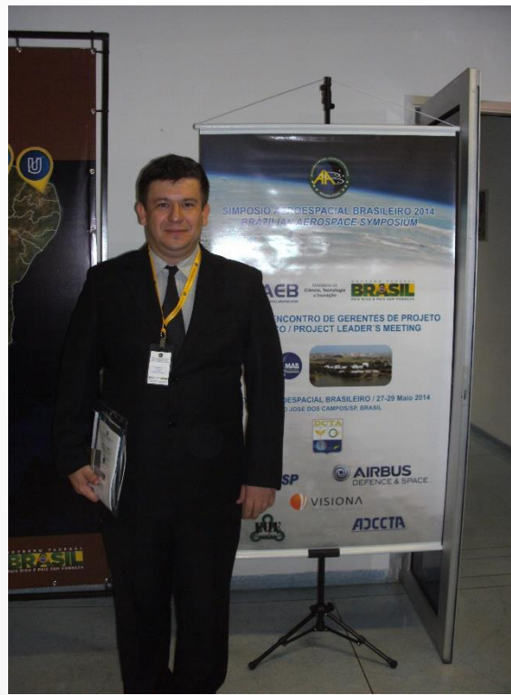
Brazilian Aerospace Symposium