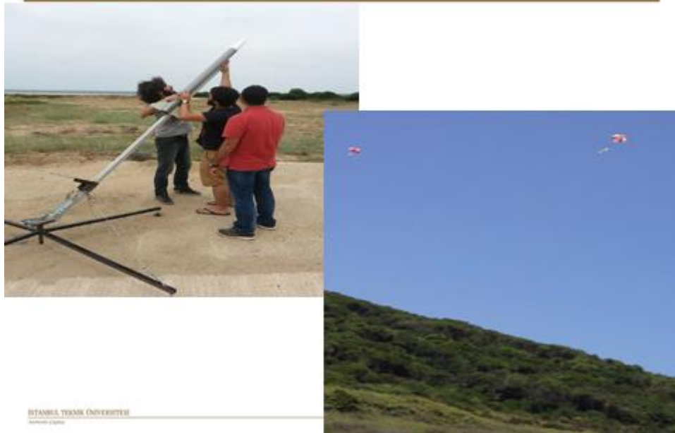
Figure 3: Launch of CanSats during 1 st UTEB CLTP