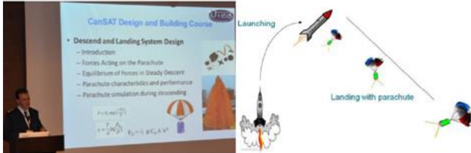
Figure: UTEB's 1 st CLTP Course hold in İTÜ from 15 to 27 th of June, 2014