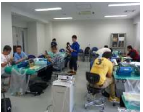
CanSat Hands-on Training