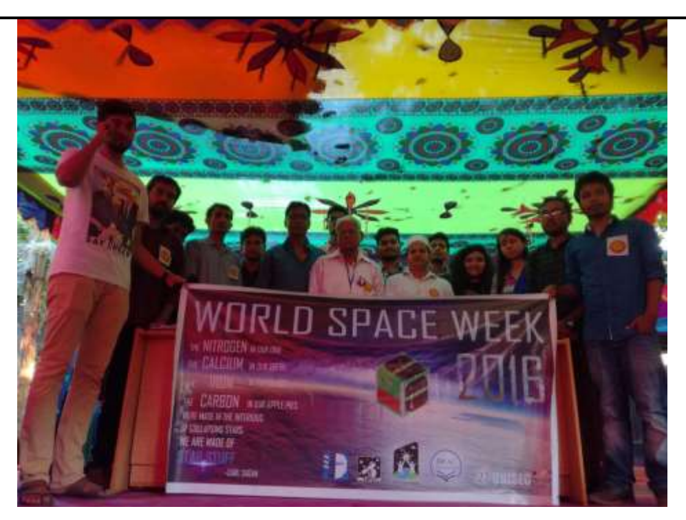
Picture 2: Bangladesh Astronomical Society invited UNISEC Bangladesh team at Enayetpur